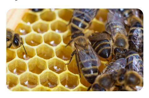
honey from bees