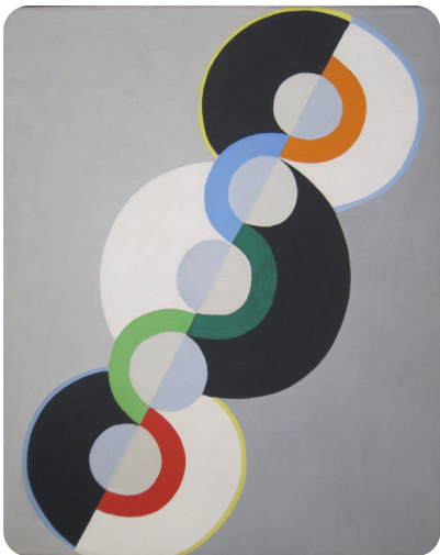
This painting, by Robert Delaunay, is called Endless Rhythm . It represents the movement of music through endlessly connected circles and loops.

Orphism was an abstract painting style developed by married artists Robert and Sonia Delaunay around 1912. It was based on Cubism but pioneered a new emphasis on bright colours and abstract shapes to create energy and movement.