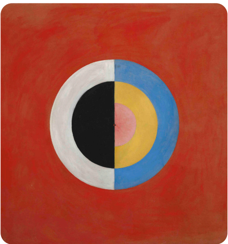
This painting, by Hilma af Klint, is called The Swan No. 17 . The subject matter has been reduced to pure shape and colour. Without knowing the title of the piece, the viewer would not know that the painting represents a swan.

Abstract art takes recognisable objects or forms and changes them until they no longer look realistic. Abstract art allows artists to freely communicate their ideas in a way that is not limited by reality. The artist may leave out details, change the point of view, exaggerate the size, distort the shapes and colours or twist and simplify forms.