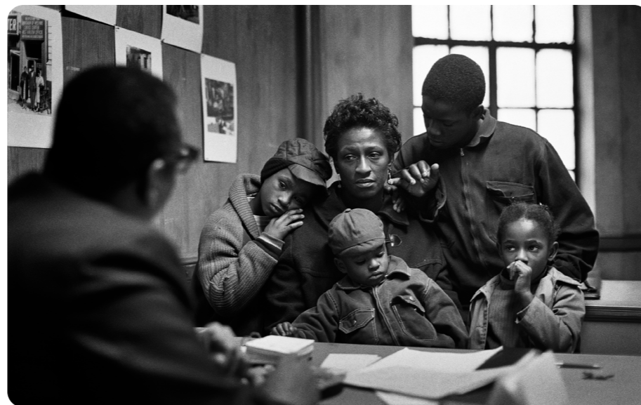
The Fontenelles at the Poverty Board

The Fontenelles at the Poverty Board (1967) by Gordon Parks shows a poor, black family in New York, symbolising the hardship many endured in the USA.