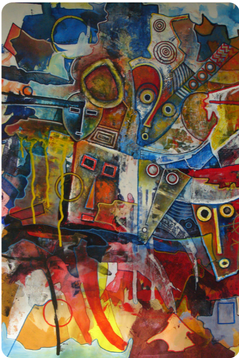
Another Call from Africa

Another Call from Africa (2009) by Turgo Bastien uses bright colours and African masks to celebrate African culture. Masks play an important spiritual and religious role in African societies and are therefore a significant feature within Turgo Bastien's work.