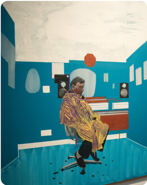
Peter's Sitters 3

Peter's Sitters 3 (2009) by Hurvin Anderson connects his Caribbean heritage with life in England. Colour symbolises his Caribbean heritage, while the barbershop symbolises an important aspect of life in England to Afro-Caribbean immigrants.