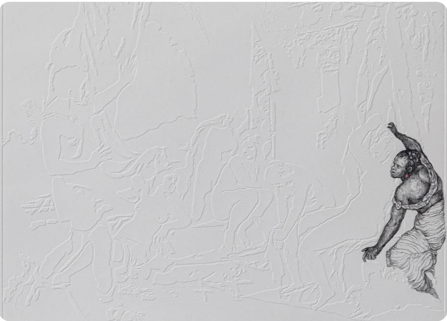
Vanishing Point 7