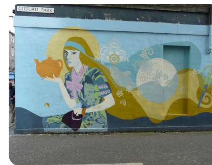
The Gifford Park mural by Kate George, 2015

A mural is a large picture that is usually painted onto a wall, ceiling or other structure.