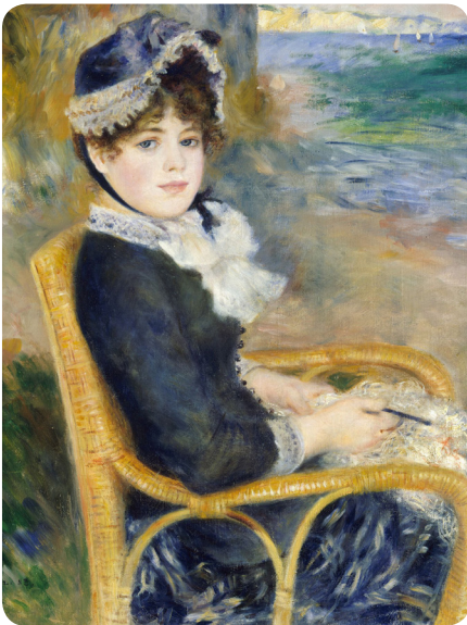
The textures of these two portraits are similar but the colours are different.