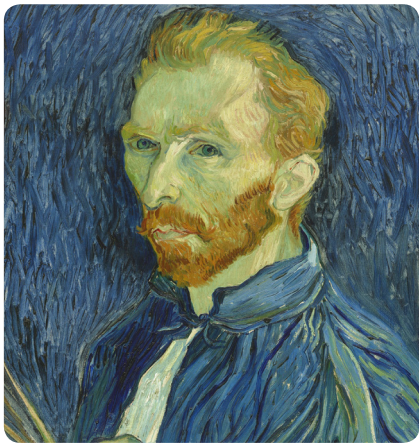
Self-portrait, Vincent van Gogh, 1889

A self-portrait is a portrait that an artist produces of themselves. Vincent van Gogh painted many self-portraits.