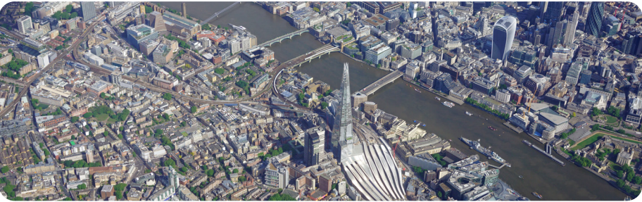
Aerial view of London

A city is a large, busy settlement where lots of people live and work. A city usually has a cathedral, a river, important buildings and offices where people work. There are lots of things to see and do in a city. There are many shops and restaurants to visit.