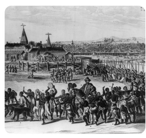
Illustration of Benin City, 1668

Humans have lived in Africa for millions of years. Great civilisations developed in every part of Africa, including the Kingdom of Aksum, the Kingdom of Benin and the Mali Empire. Each were great trading nations and gained wealth and power by trading natural resources, such as gold and salt, with other African kingdoms, Europe, the Middle East, India and China.