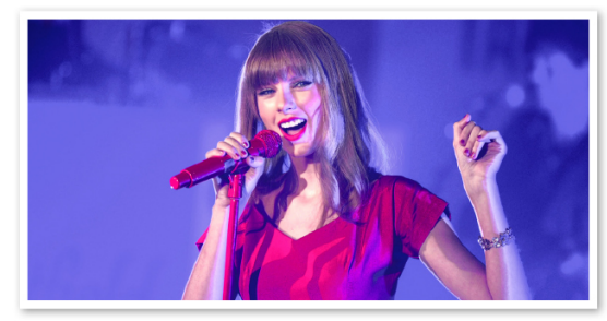
Taylor Swift is a pop and country music singer

Country music came from the southern United States. It often tells a story accompanied by string instruments, such as banjos, guitars and violins.