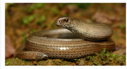
Grass snakes and slow worms are reptiles.