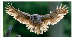
Blackbirds and tawny owls are birds.