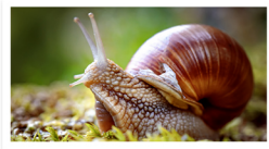
Ground beetles and garden snails are invertebrates.