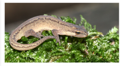
Common toads and smooth newts are amphibians.