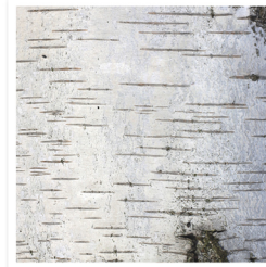
silver birch bark