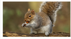
Red foxes and grey squirrels are mammals.