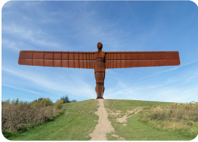
Angel of the North – Sir Antony Gormley

7. Public art, such as statues, murals and sculptures, often tell us about the history of a place. Find out where these examples can be found and write a short paragraph about each piece to explain what it tells you about the history of the place where it is located.