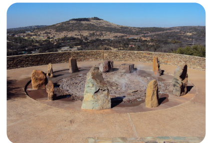
Freedom Park – Mongane Wally Serote