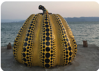
Pumpkin – Yayoi Kusama