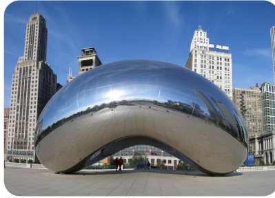
Cloud Gate – Anish Kapoor