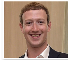
Mark Zuckerberg co-founder of the social-networking site Facebook