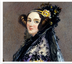
Ada Lovelace first computer programmer