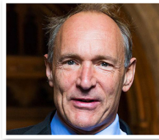
Sir Tim Berners-Lee creator of the World Wide Web, the system used to access the internet