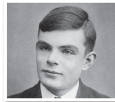
Alan Turing computer science pioneer