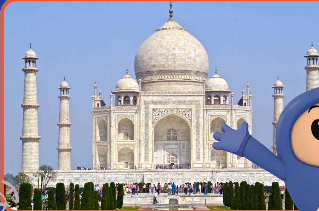
Taj Mahal, India