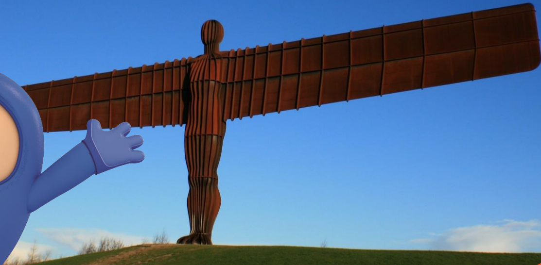
Angel of the North, Gateshead, UK