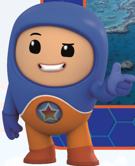
Great Barrier Reef, Australia