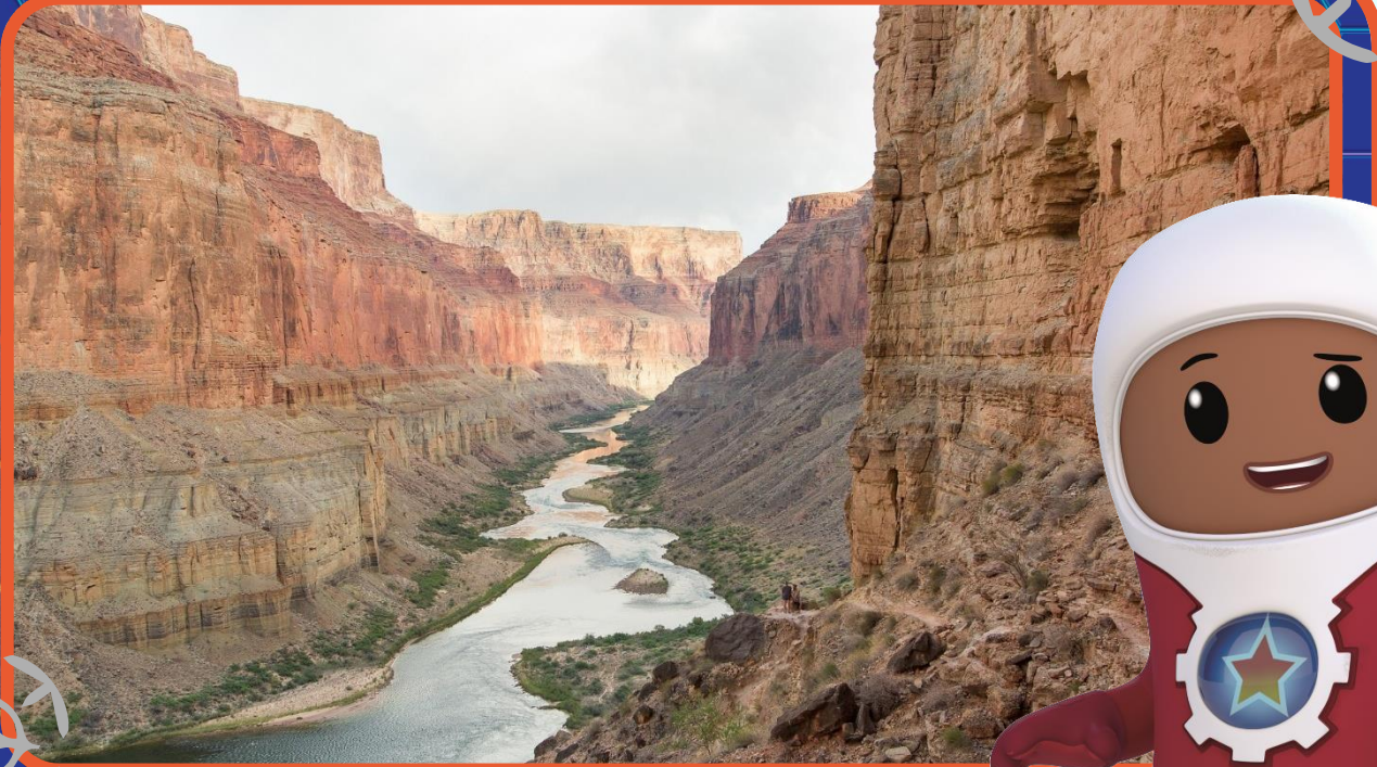
Grand Canyon, USA