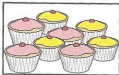
Box of 8 cupcakes

A shop sells cupcakes in boxes of 8 and boxes of 6