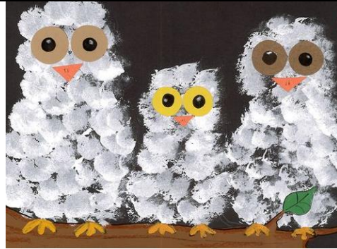
Another nice way to make your owls.